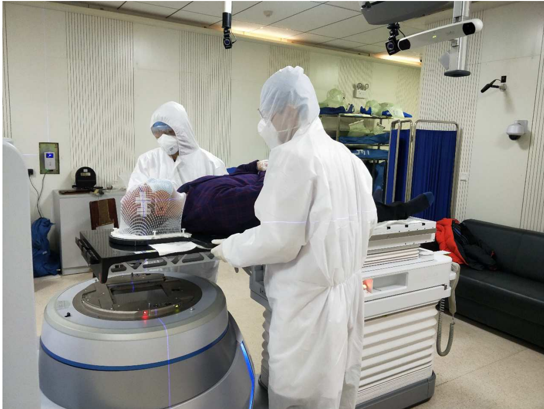
Figure 2: Example picture showing two radiation therapists in PPEs setting up a glioblastoma patient with a modified thermoplastic mask immobilization device with a surgical mask underneath.