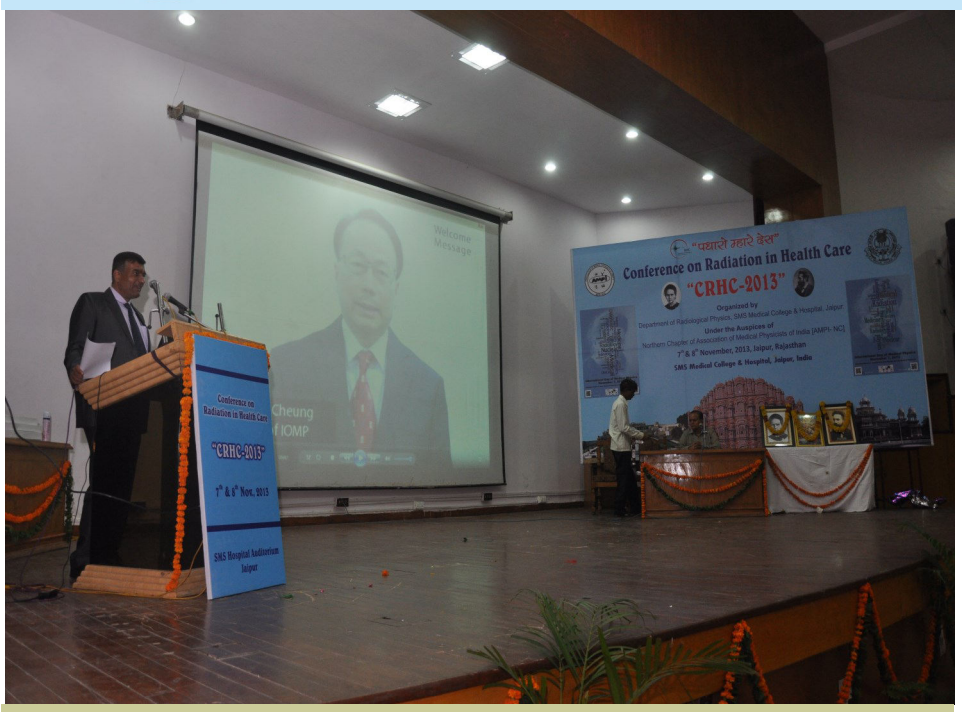
International Day of Medical Physics [IDMP], 7th November, Jaipur, India

7<sup>th</sup> & 8<sup>th</sup> November, 2013, Jaipur, Rajasthan